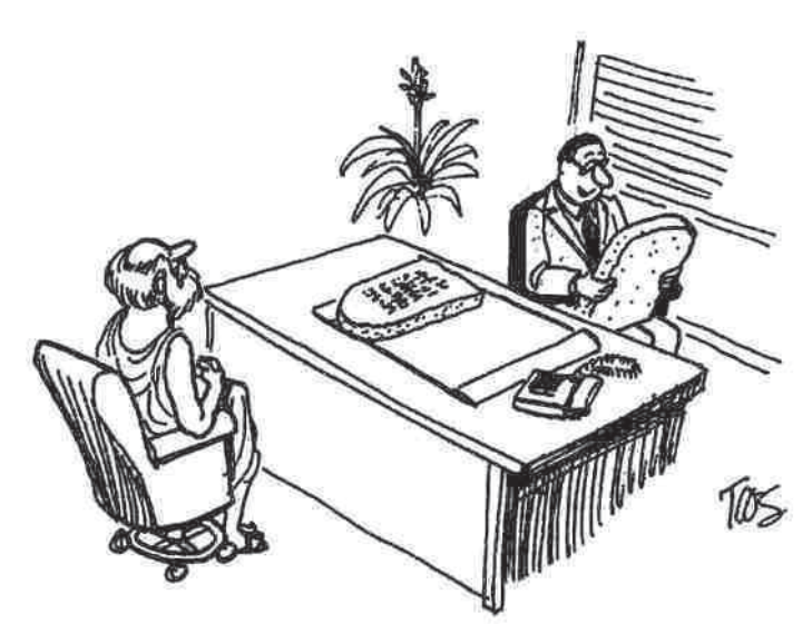
"Moses, this chapter outline is really impressive."

Finally, these writers built trusted relationships with their editors—newspaper and magazine. Many of the editors I've worked with have moved up to higher paying publications or have become book editors or editorial directors. The seeds of my relationship with them were planted through my magazine writing. As a new writer you need to understand the necessity of building these lasting relationships.